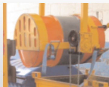
Drum Tilting Unit