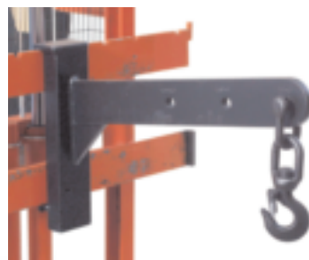
Jib and Hook