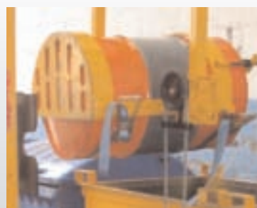
Drum Tilting Unit