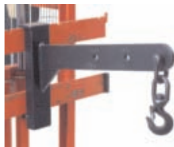
Jib and Hook