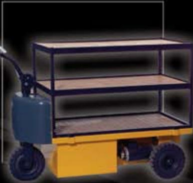
> 750KG Platform Truck POPT750