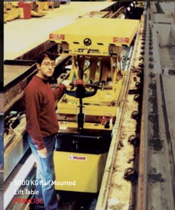
> 5000 KG Rail Mounted Lift Table FORMLTSO