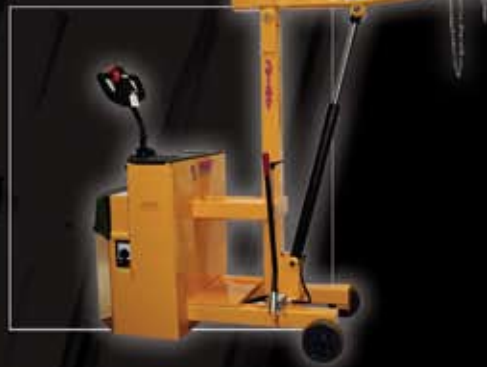
> 700KG 1.5 Simplex Mast Counterbalanced Stacker PDCB7