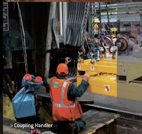
> Coupling Handler