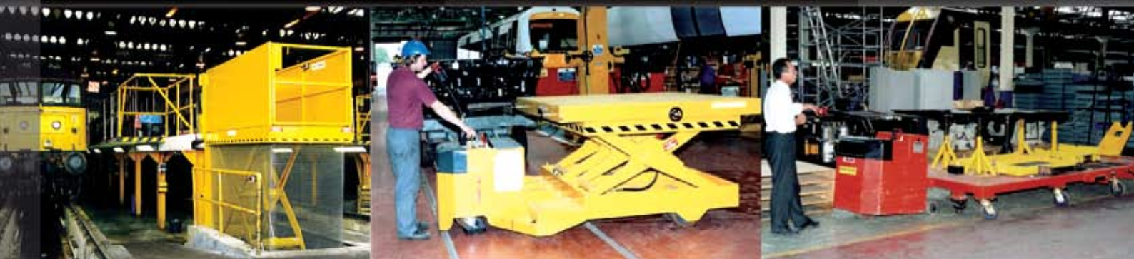
> 8000KG Castor Mounted Assembly Platform Tug Unit POPM40

> WILMAT can provide... HANDLING SOLUTIONS